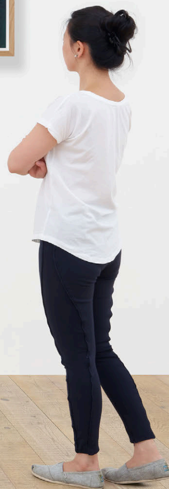
D3-5A (Top) 167.8 x 270.4 cm (framed)