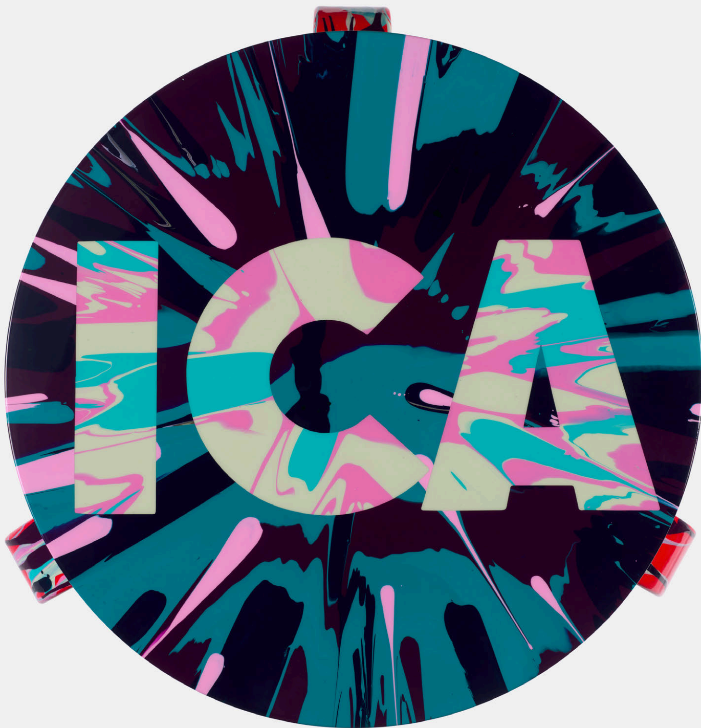
Damien Hirst ICA162, 2025 Acrylic paint on wood 44 (h) × 38 (ø) cm