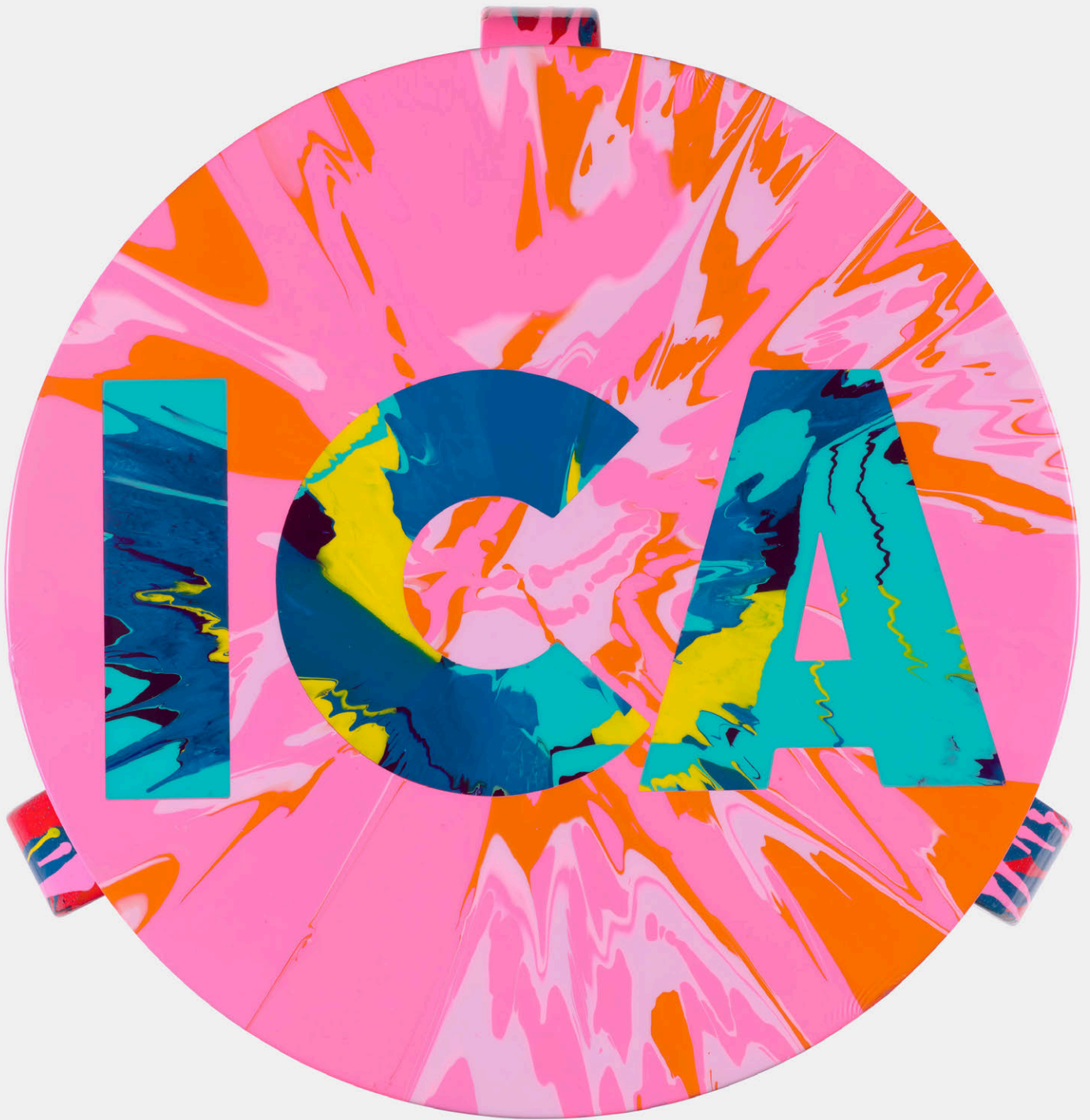
Damien Hirst ICA81, 2025 Acrylic paint on wood 44 (h) × 38 (ø) cm