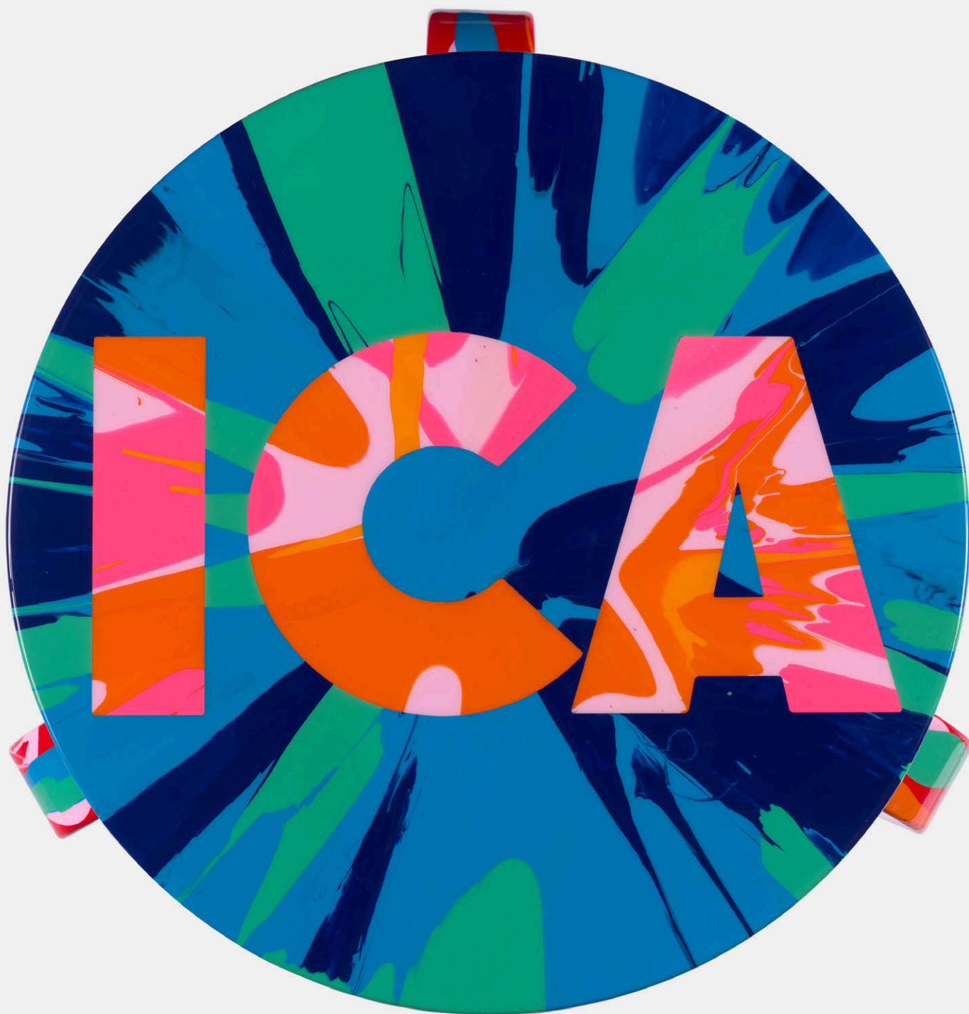
Damien Hirst ICA137, 2025 Acrylic paint on wood 44 (h) × 38 (ø) cm