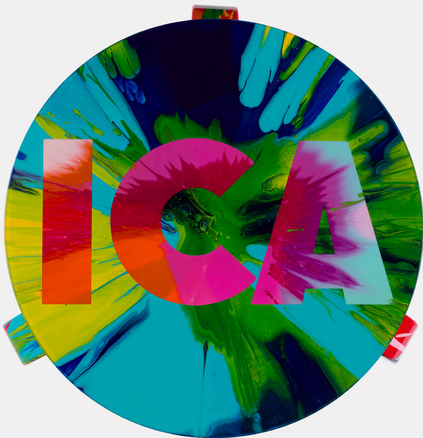
Damien Hirst ICA172, 2025 Acrylic paint on wood 44 (h) × 38 (ø) cm