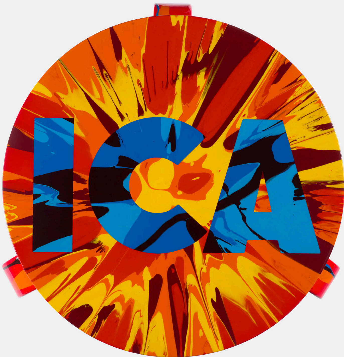
Damien Hirst ICA106, 2025 Acrylic paint on wood 44 (h) × 38 (ø) cm