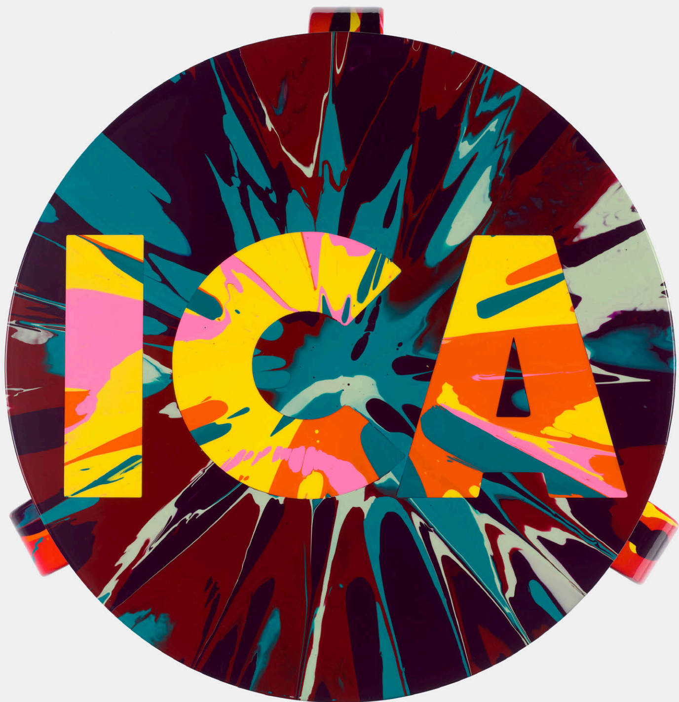
Damien Hirst ICA56, 2025 Acrylic paint on wood 44 (h) × 38 (ø) cm