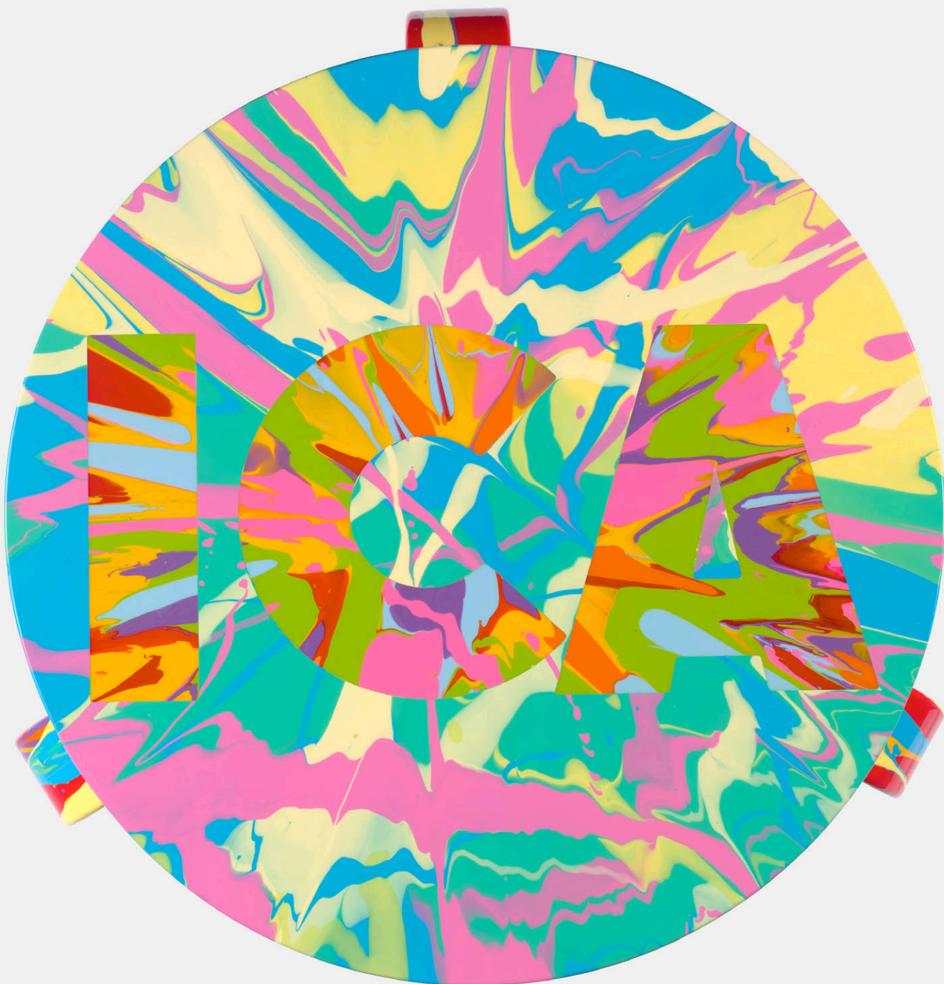
Damien Hirst ICA21, 2025 Acrylic paint on wood 44 (h) × 38 (ø) cm