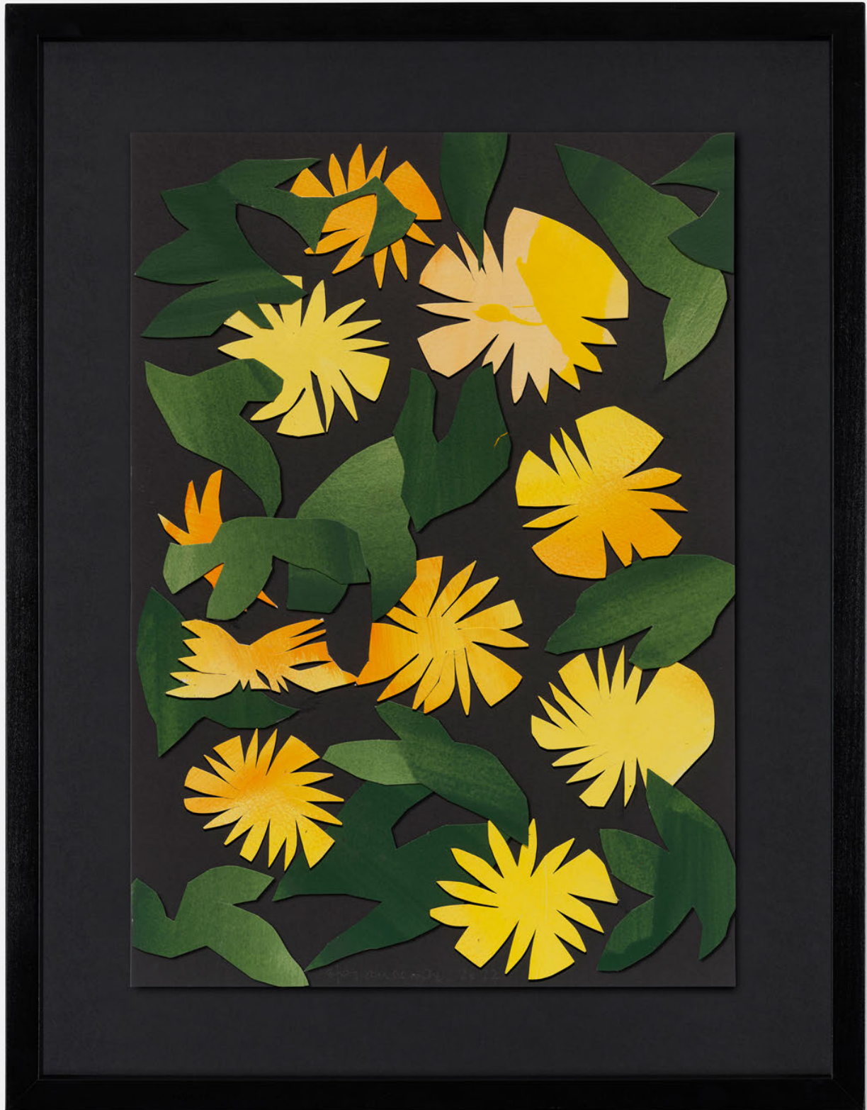
CL118. Peel Cottage Garden Brian Clarke

2022, acrylic painted paper collage on black card 42 x 29.5 cm (52 x 40 cm framed)