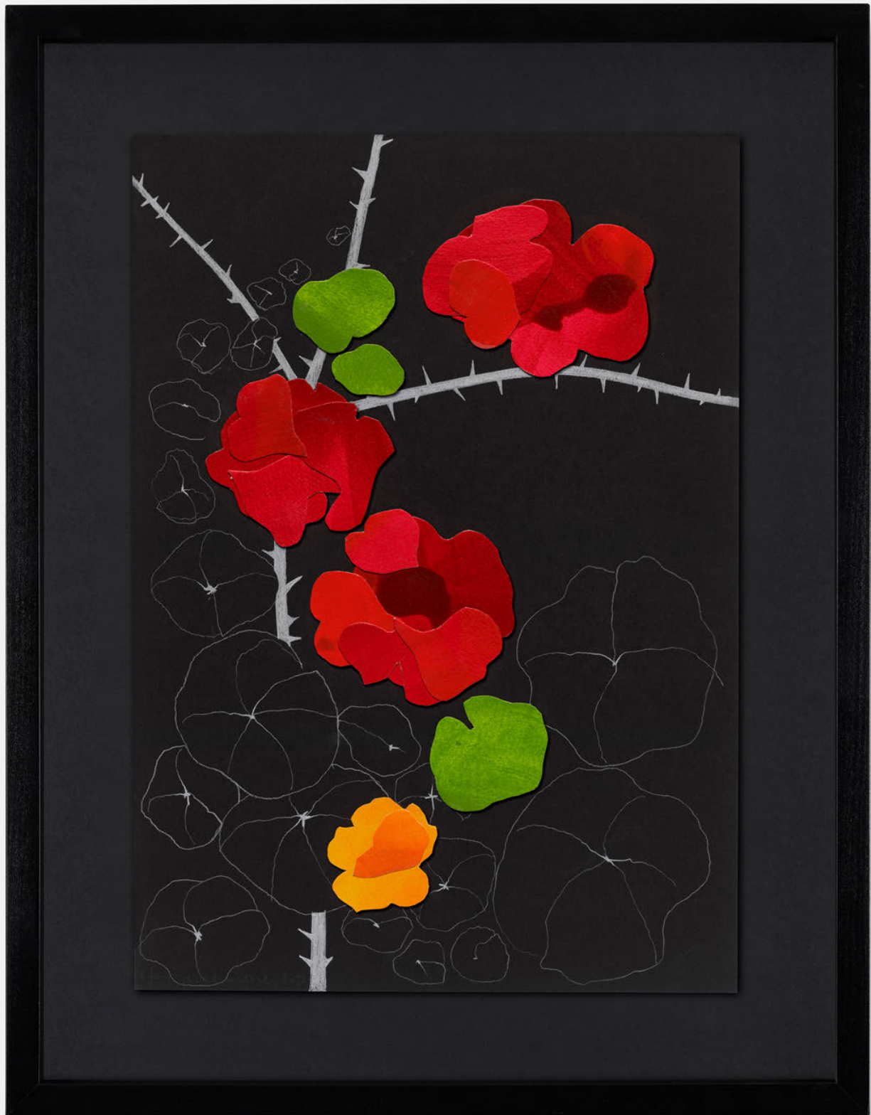
CL123. Peel Cottage Garden Brian Clarke

2022, white pencil and acrylic painted paper collage on black card 42 x 29.5 cm (52 x 40 cm framed)