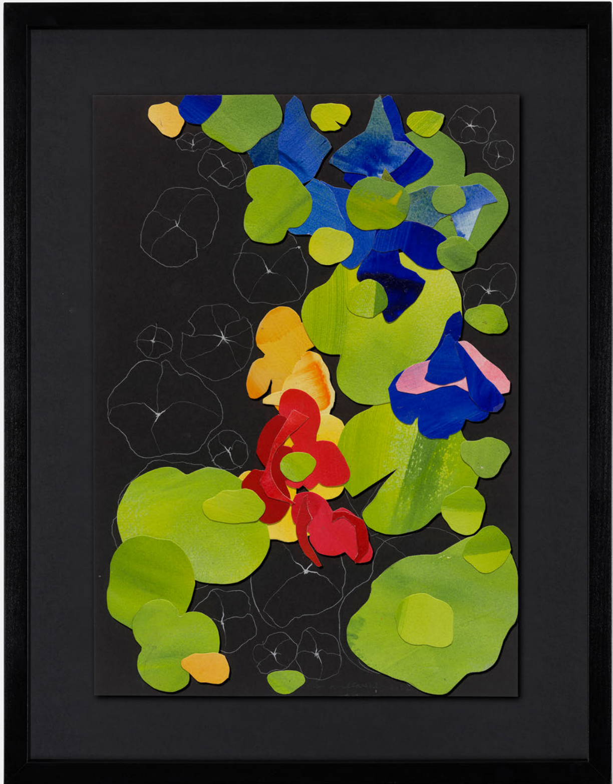
CL120. Peel Cottage Garden Brian Clarke

2022, white pencil and acrylic painted paper collage on black card 42 × 29.5 cm (52 × 40 cm framed)