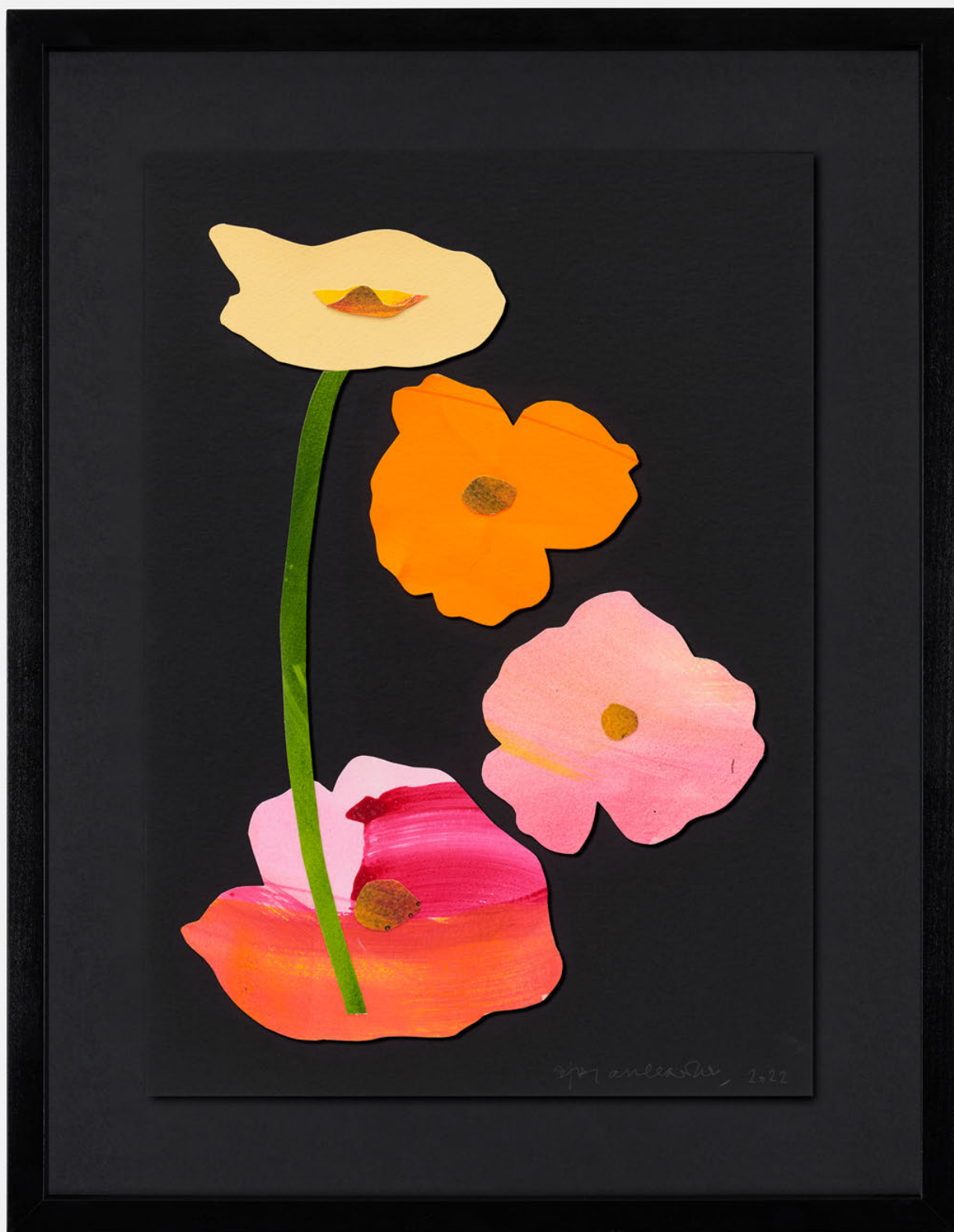
CL160. Studies for Bahrain Brian Clarke

2022, acrylic painted paper collage on black card 42 x 29.5 cm (52 x 40 cm framed)