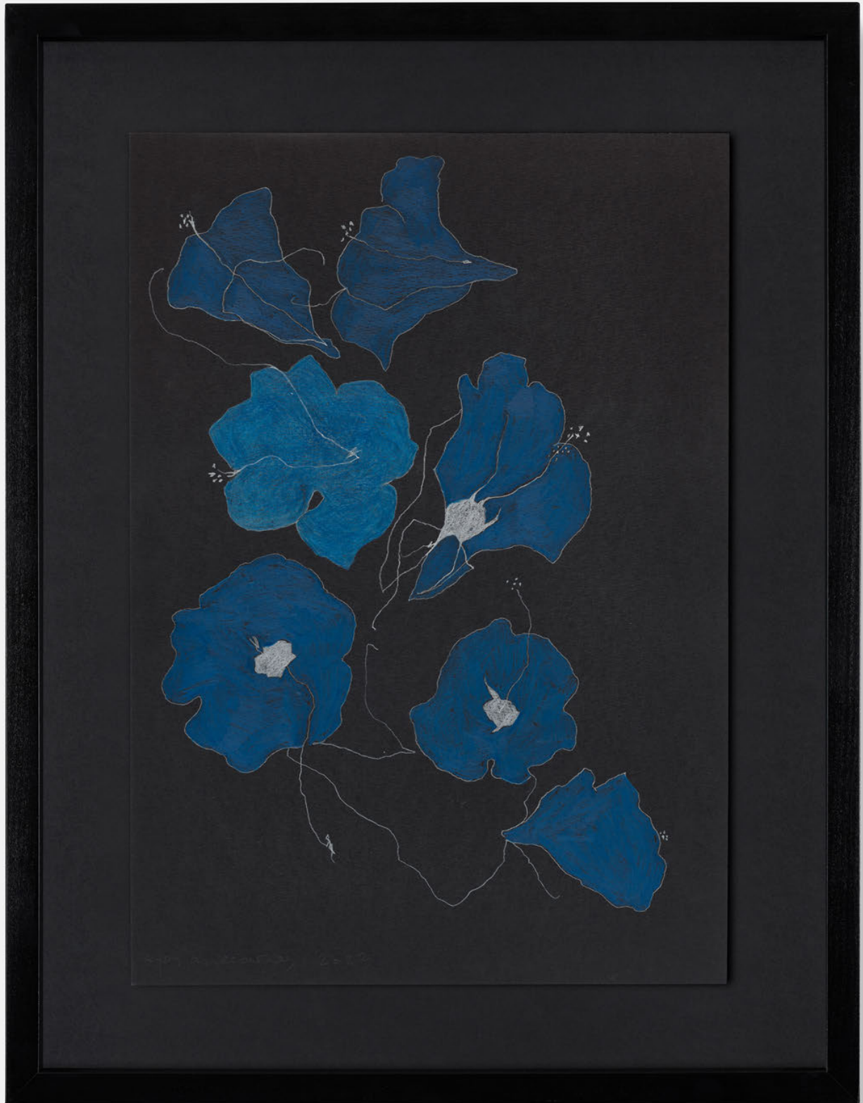
CL67. Ibiza Brian Clarke

2022, Colour pencil on black card 42 x 29.5 cm (52 x 40 cm framed)