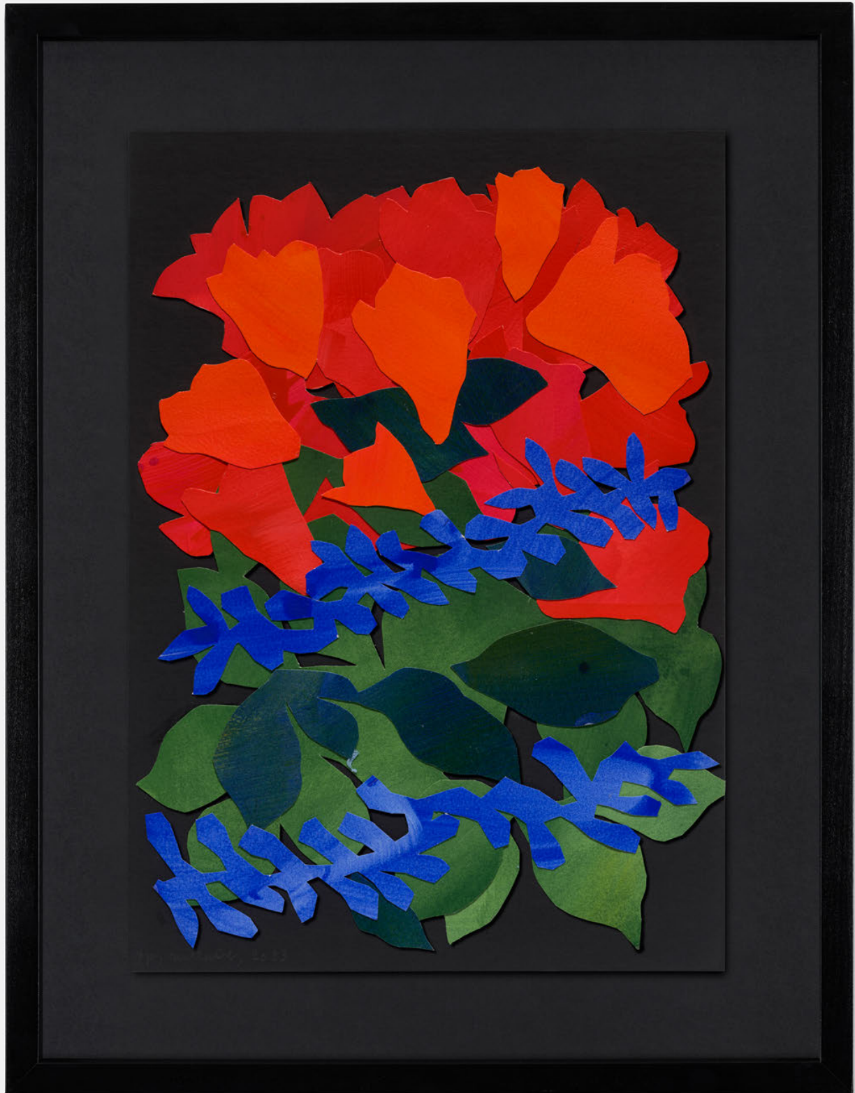
CL237. London Clinic Brian Clarke

2023, acrylic painted paper collage on black card 42 x 29.5 cm (52 x 40 cm framed)