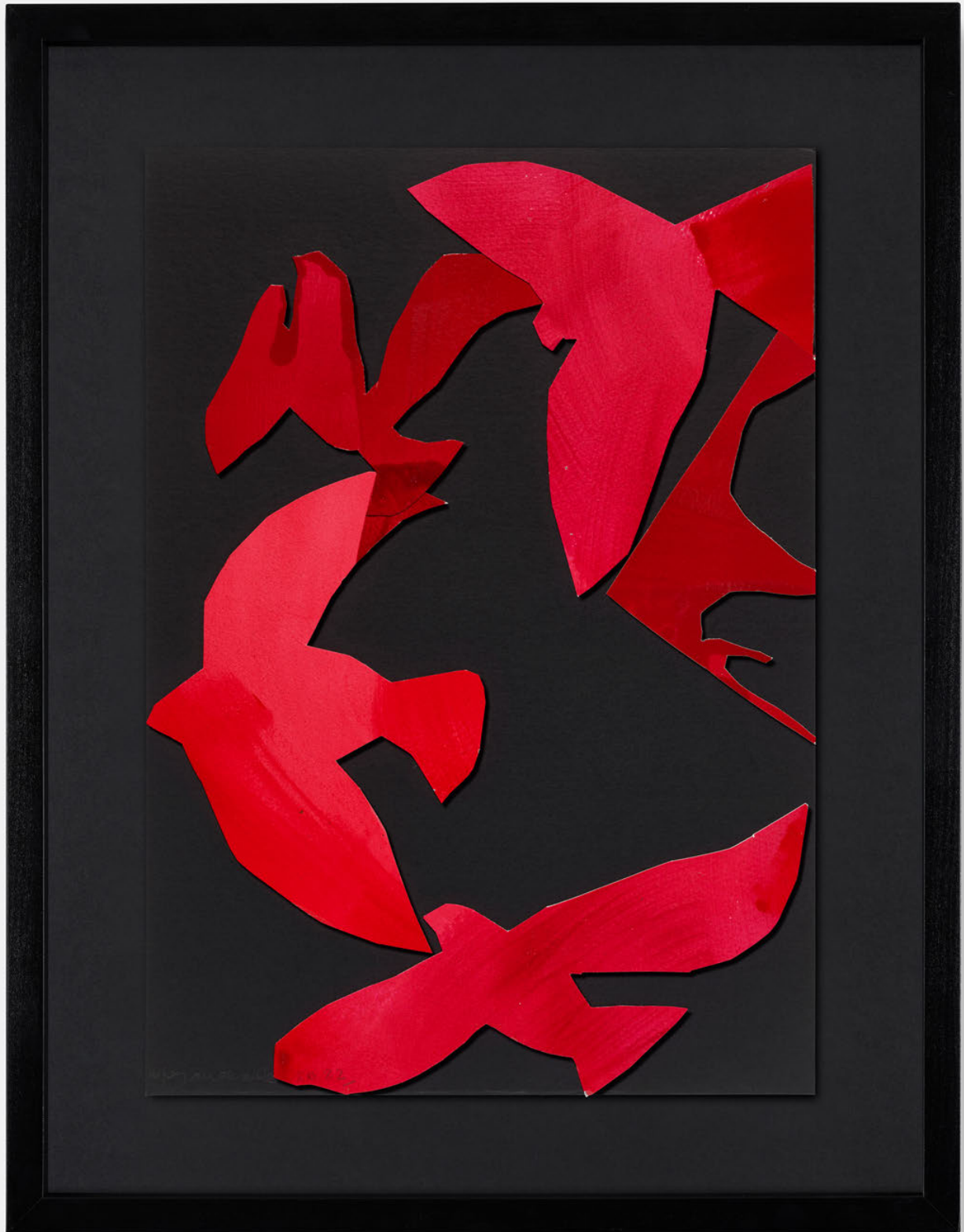
CL167. Studies for Bahrain Brian Clarke

2022, acrylic painted paper collage on black card 42 x 29.5 cm (52 x 40 cm framed)