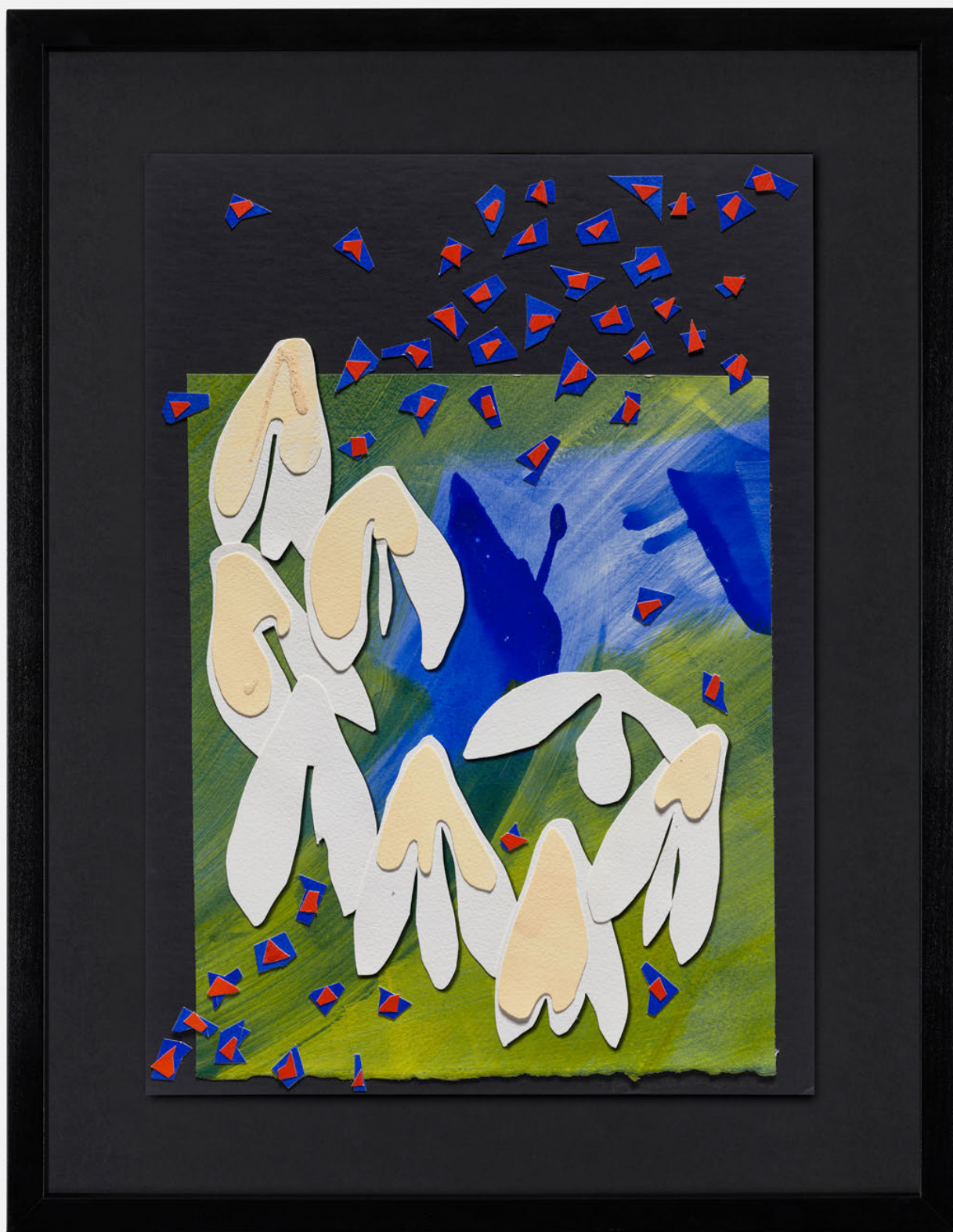
CL272. London Clinic Brian Clarke

2023, acrylic painted paper collage on black card 42 x 29.5 cm (52 x 40 cm framed)