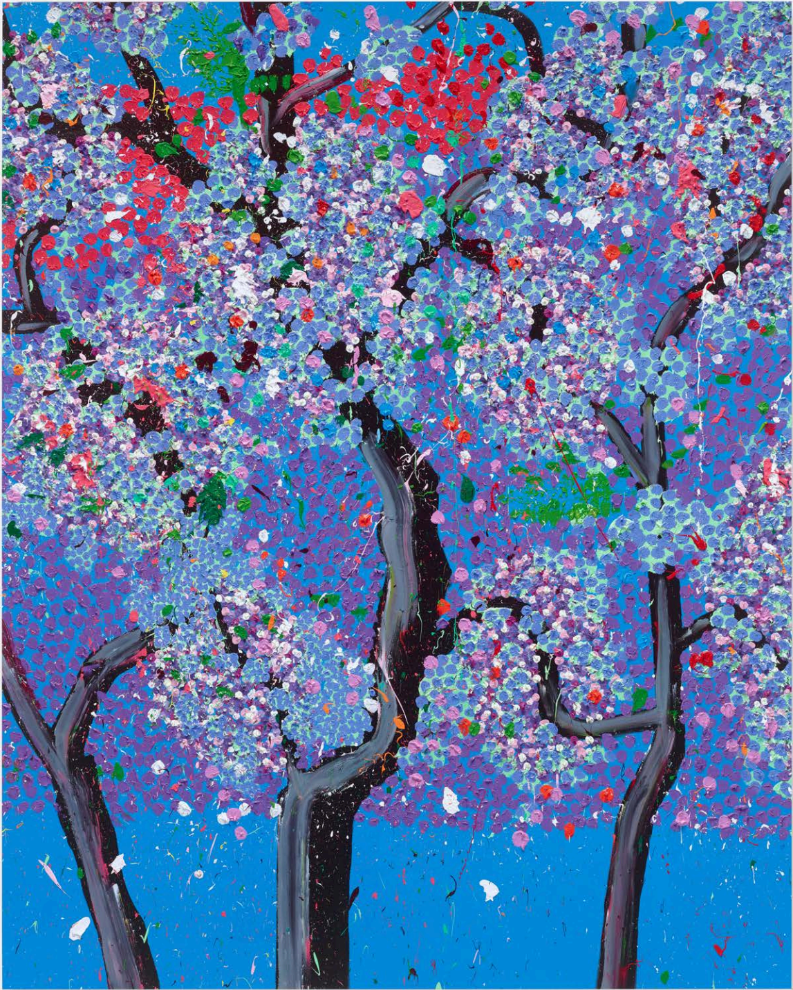
Damien Hirst Anticipation, 2026 H20-6 Giclée direct print on aluminium composite panel 120 x 96 cm