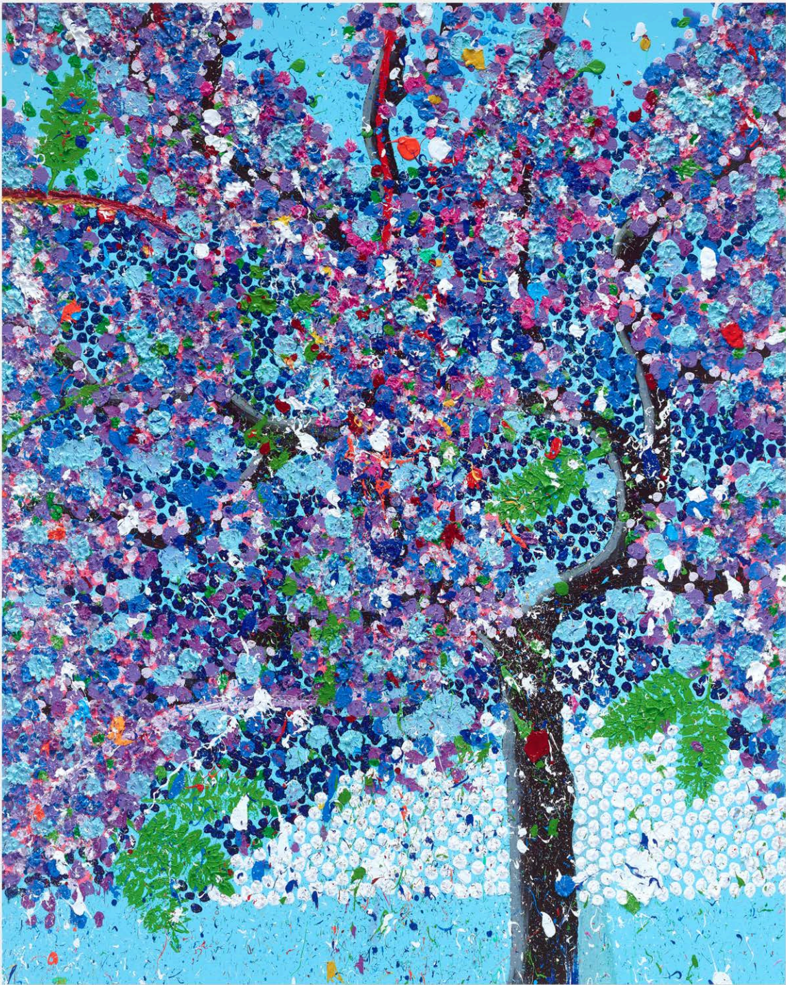
Damien Hirst Surprise, 2026 H20-3 Giclée direct print on aluminium composite panel 120 x 96 cm