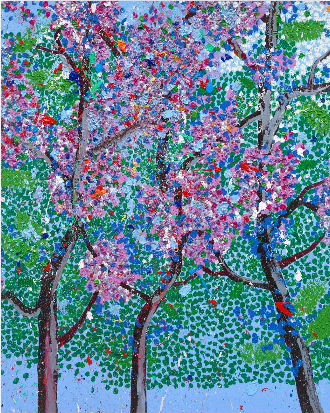
Damien Hirst Gratitude , 2026 H20-7 Giclée direct print on aluminium composite panel 120 x 96 cm