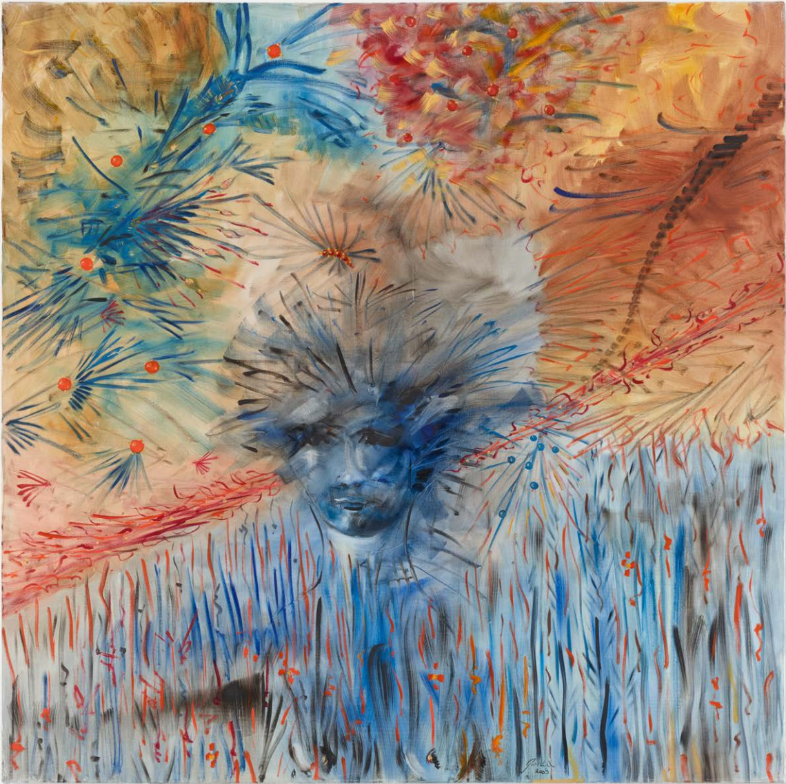
Gérald Genta Broussailles , 2003 Oil on canvas 100 x 100 cm