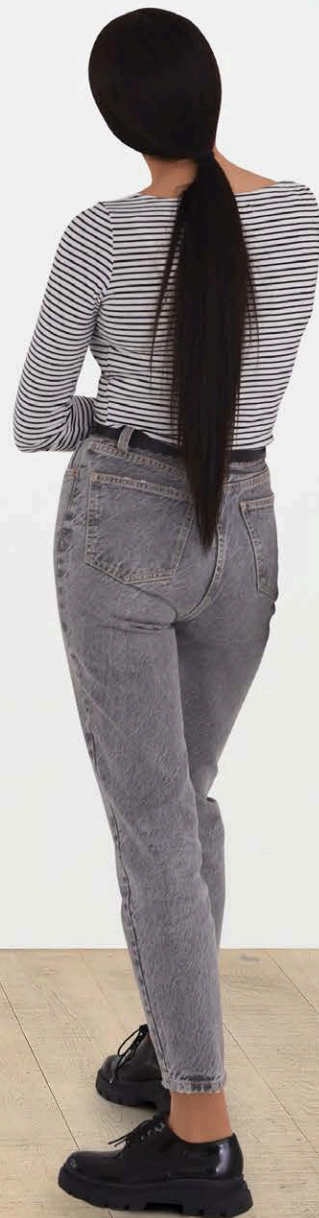
GG1-6A 120 x 120 cm