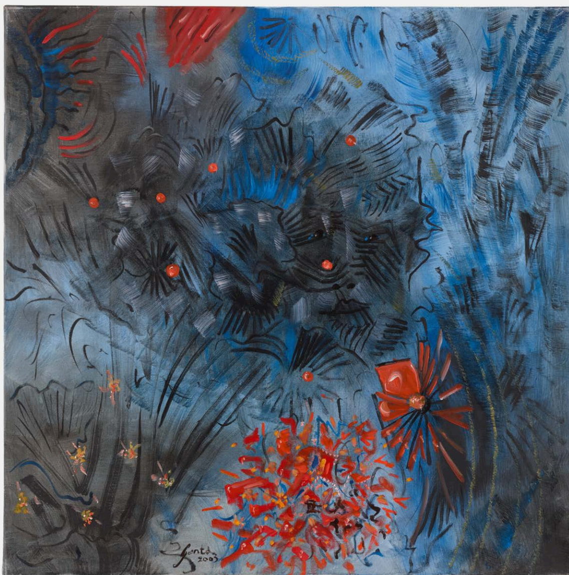
Gérald Genta Pépites , 2003 Oil on canvas 60 x 60 cm