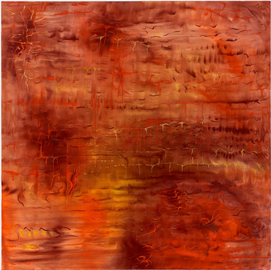
Gérald Genta Untitled 02, 2004 Oil on canvas 100 x 100 cm