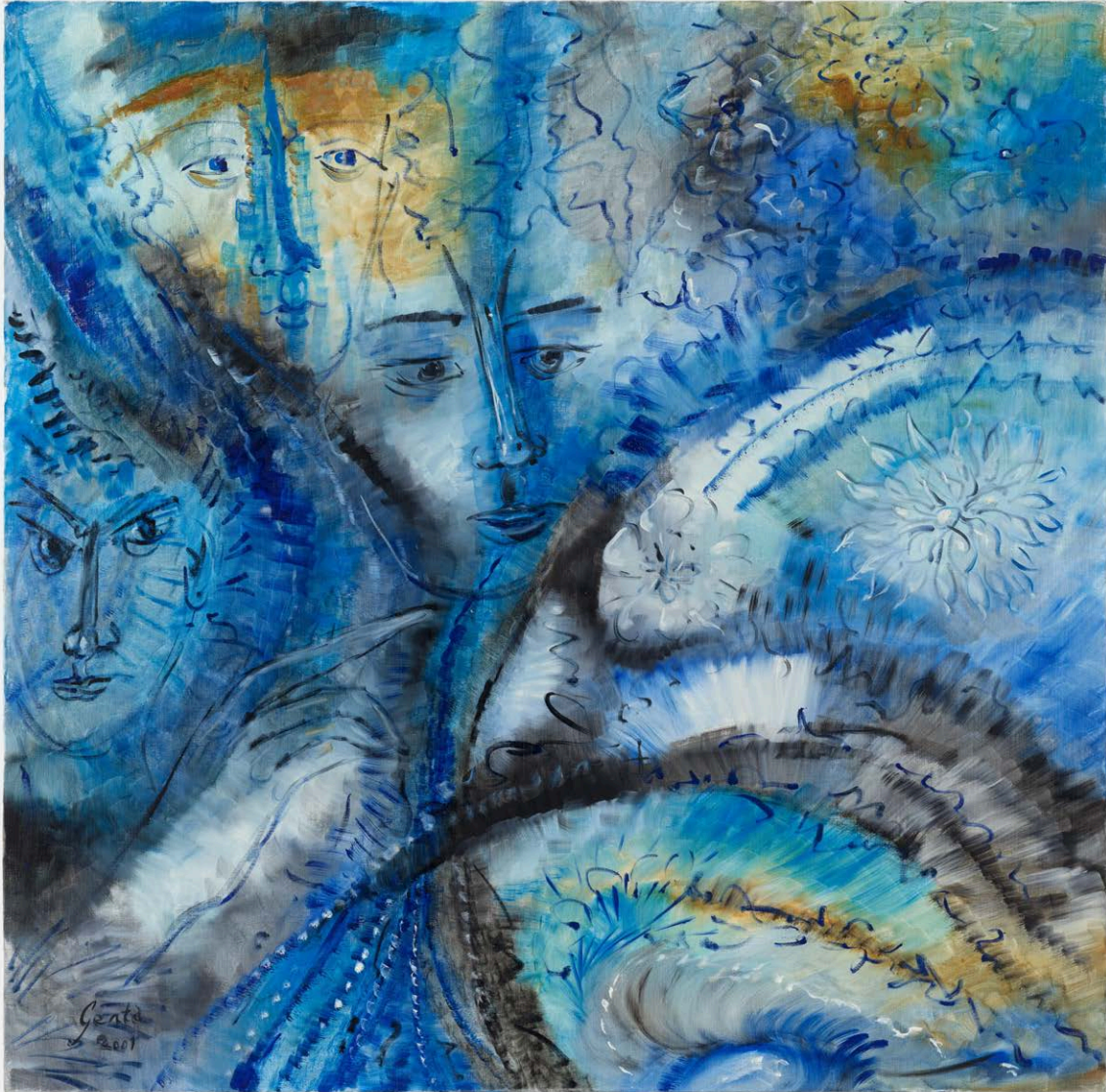
Gérald Genta Aubépine , 2001 Oil on canvas 100 x 100 cm