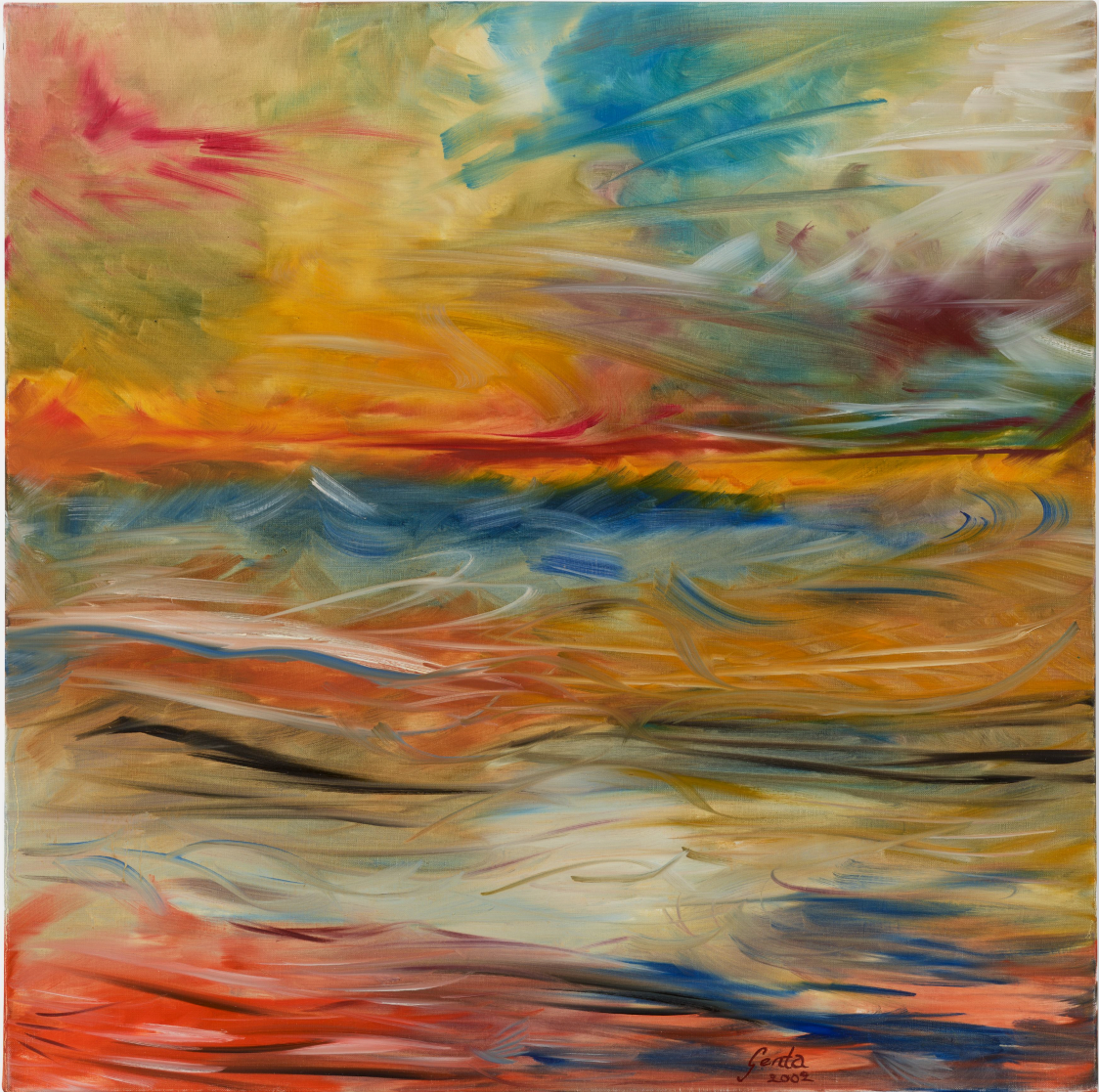
Gérald Genta Dunes au soleil, 2002 Oil on canvas 60 x 60 cm